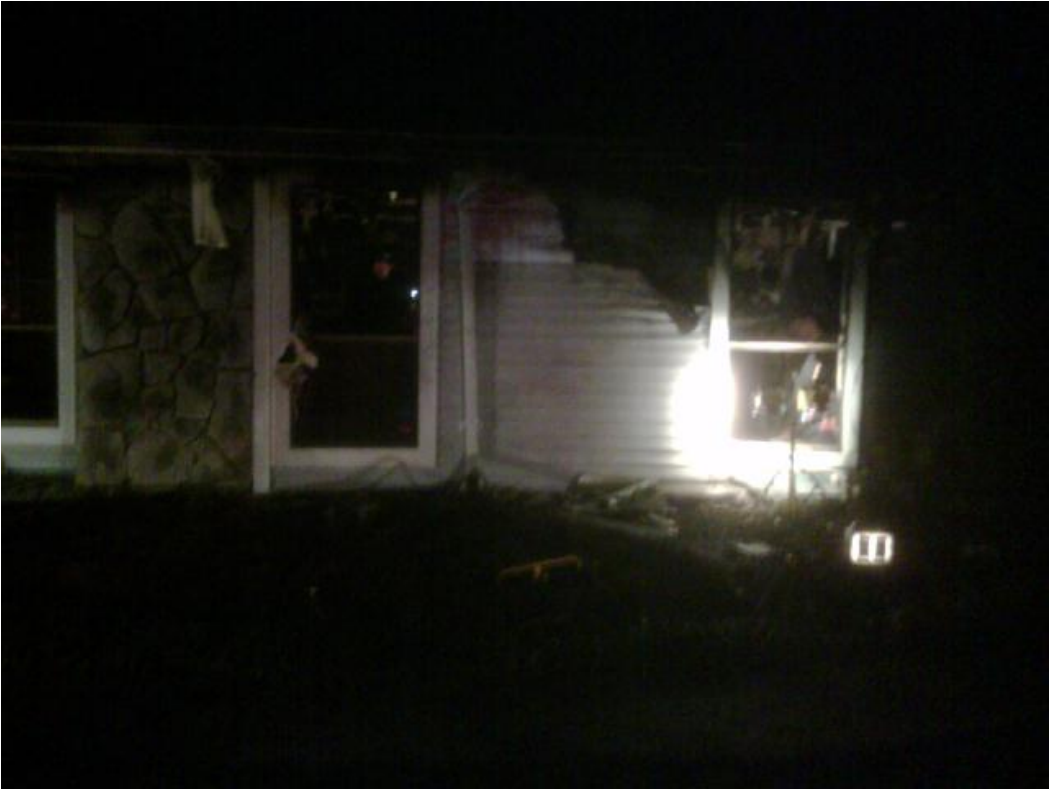
--- END END END ---