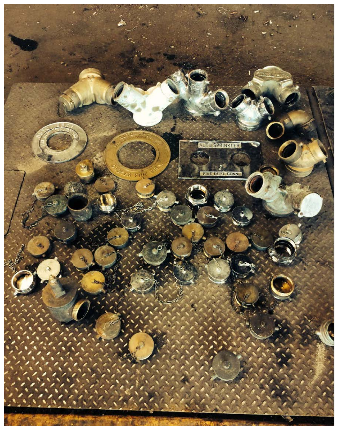
Portion of stolen fire sprinkler devices recovered by the Office of State Fire Marshal from a Kenner scrap yard; 10/21/14.